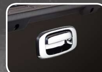
Tailgate Handle Cover