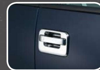
Door Handle Covers