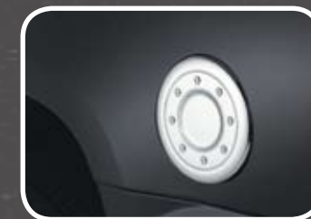
Fuel Door Cover